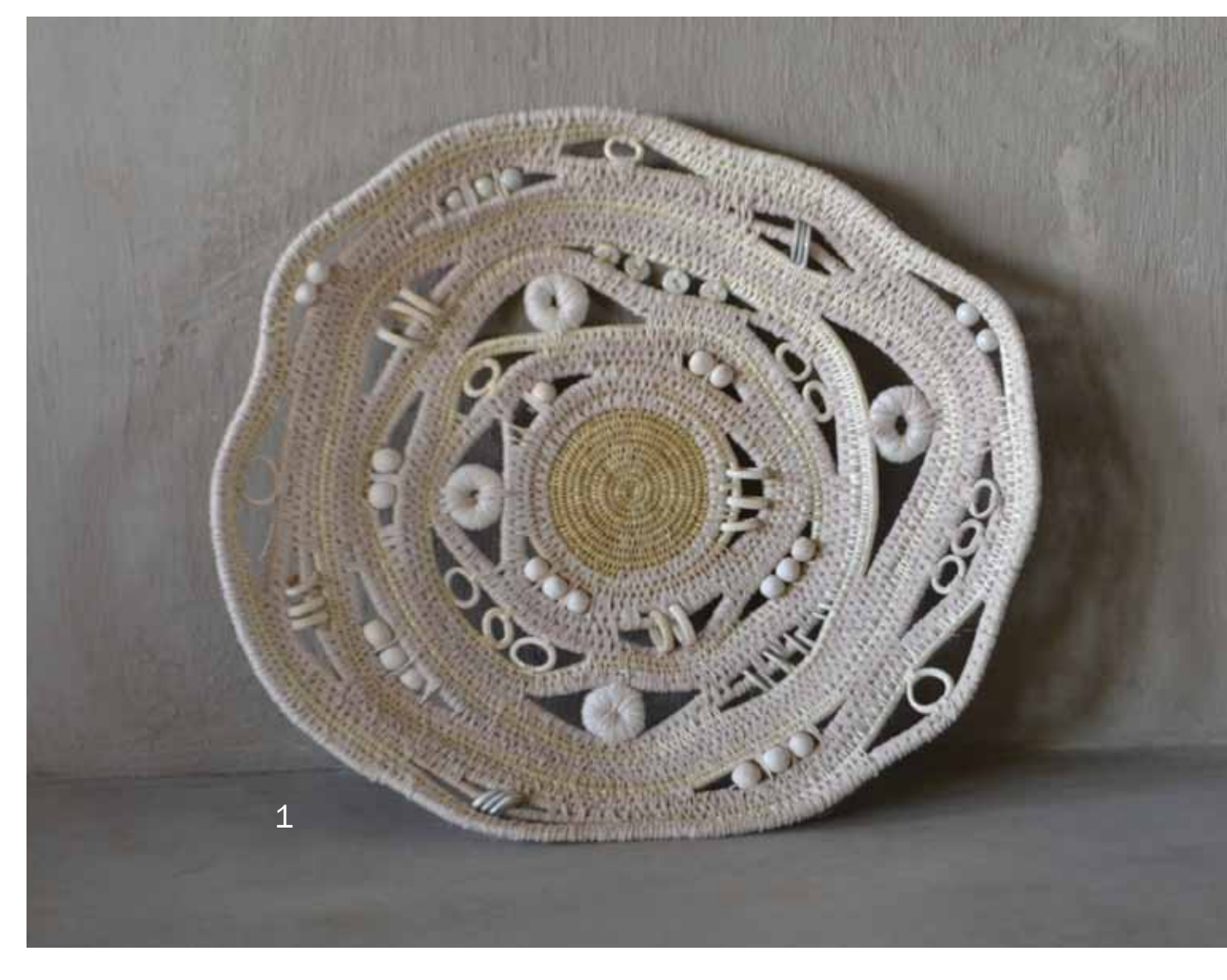
1_LACE PLATTER 60cm diameter, Lutindzi and Lucazi Grass, Sisal, Bone, Recycled fabrics, Clay Beads