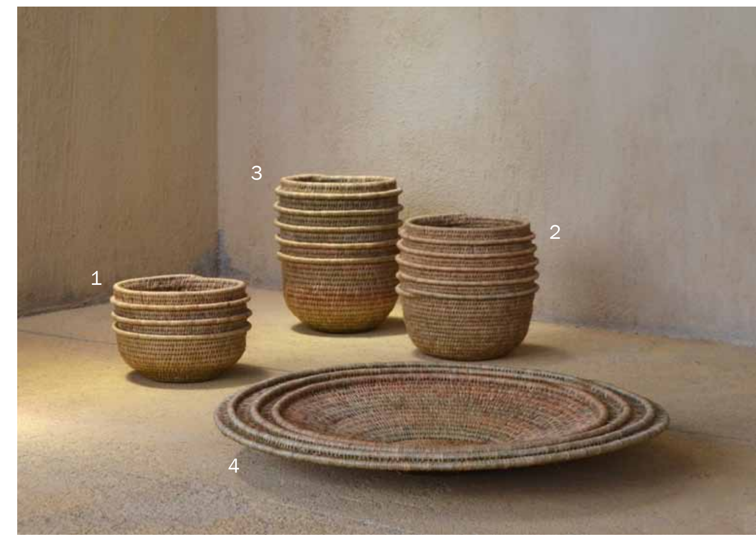
1_SMALL POT 16cm Tall, Lutindzi and Lucazi Grass