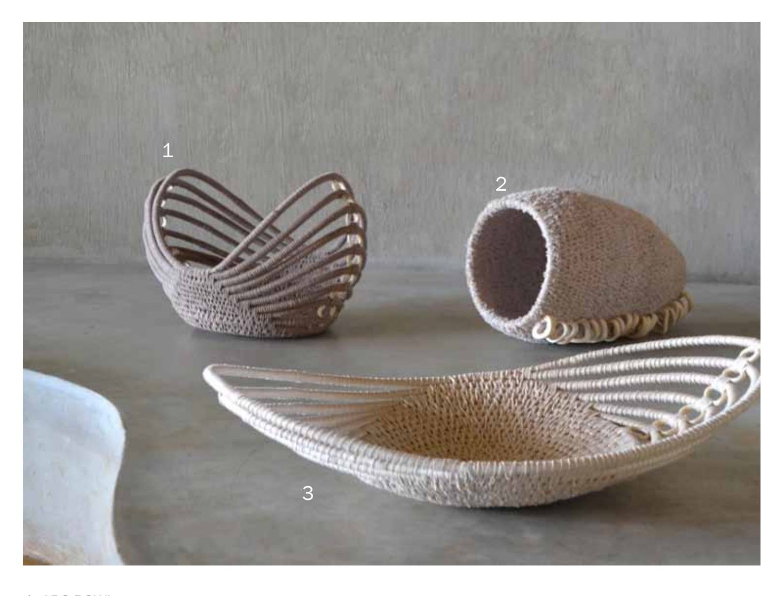
1_ARC BOWL Bone, Recycled fabric, Lucazi Grass

2_THE PILLAR Bone, Recycled fabric, Lucazi Grass